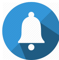
Personalised weekly notification