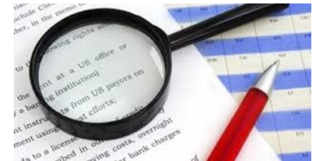
Full proposal check & Project idea check