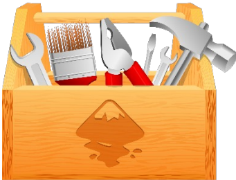
Toolbox for proposers