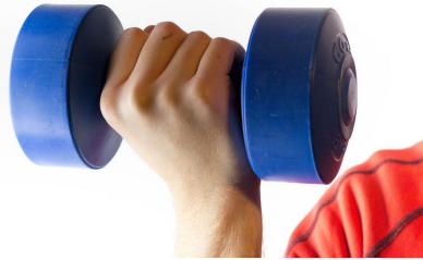
Trainings, Seminars & Webinars